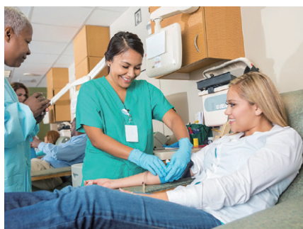
Hospital Collection blood center